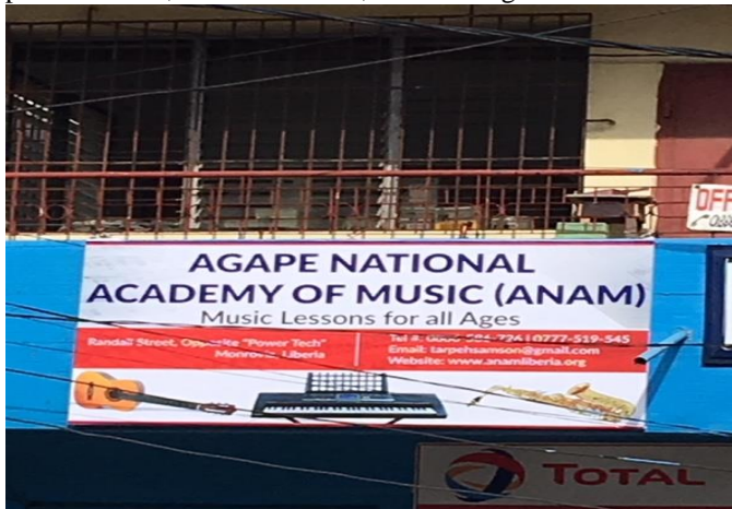
Exterior View of the Building

We have leased the Brewo House in Monrovia to run our programs. This facility houses our office, a music library, a practice room, two classrooms, and a storage area.