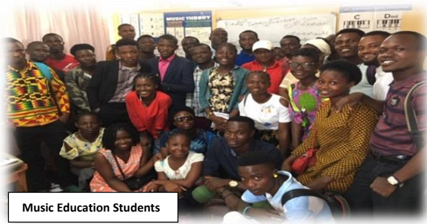
Music Education Students