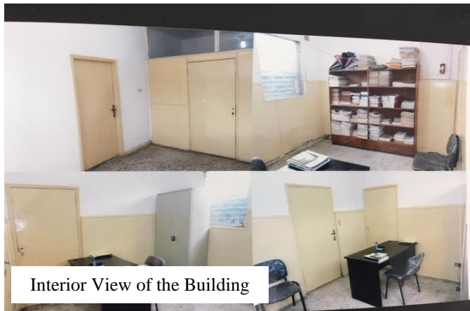
Interior View of the Building