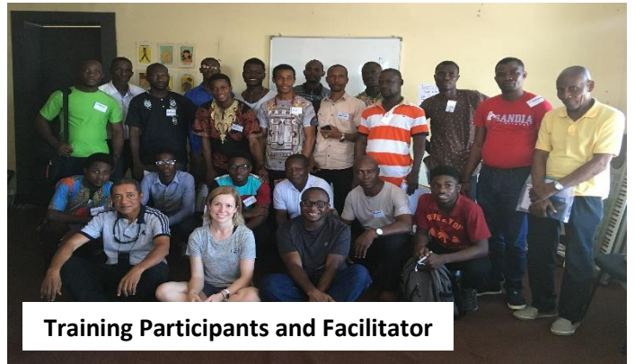
Training Participants and Facilitator