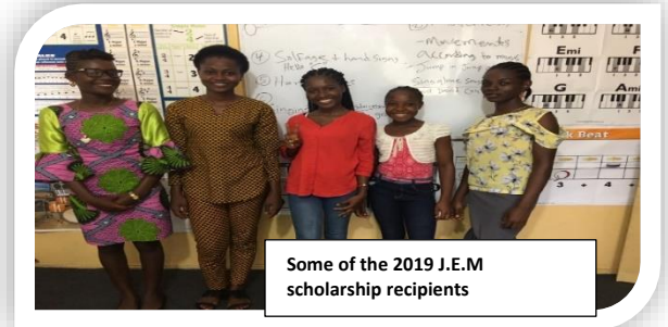
Some of the 2019 J.E.M scholarship recipients