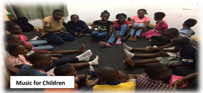
Music for Children